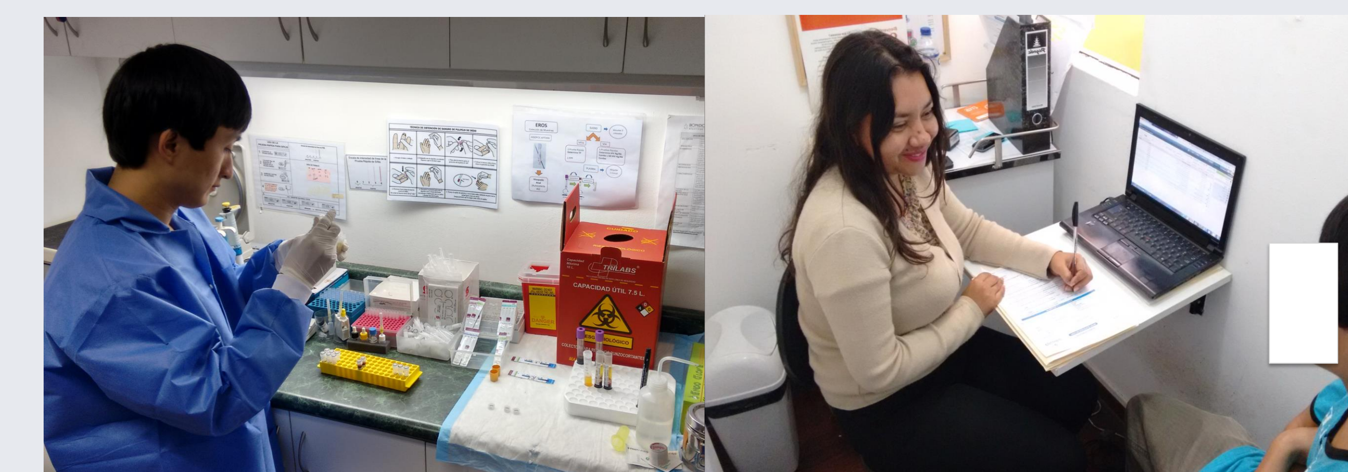
Laboratory testing and counseling at Epicentro